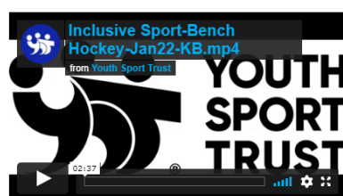
Bench Hockey - download the activity card