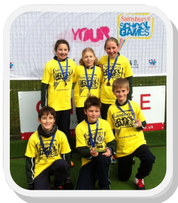
The King's School Winners of Quick Sticks Hockey finals