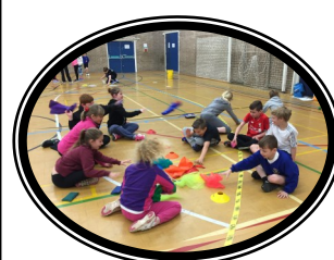
Pupils engaging in practical activity on how to use the STEP framework