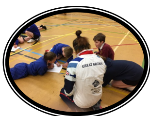
GB Judo Olympian Sophie Cox supporting pupils

Our Bronze Ambassadors from our Chester primary schools also showcased the great work they have been doing in their schools and received their special bronze pin badges for their exceptional work and commitment to their roles in school. Well done and keep up the brilliant work!