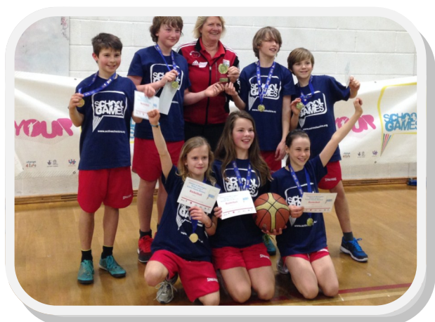
Overleigh St Mary's Winners of Mini Basketball finals