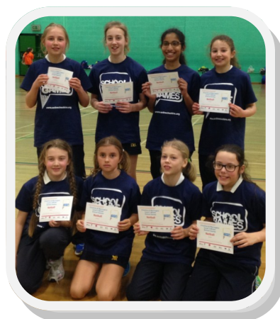
The King's School 5th Place of High 5 Netball finals