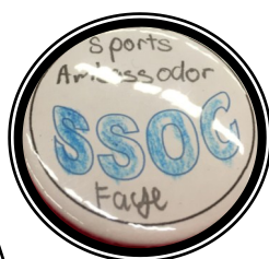
Bronze ambassadors showcasing some of their excellent work they have worked on in their school